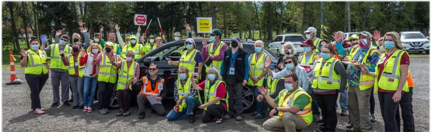
Celebrating the LAST car through the Sequim Drive-Through Vaccination Clinic!

CERT Training – After a long break in classes, due to COVID 19, CERT started classes again in June of 2021.